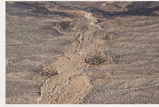
Paige Canyon Preserve.

Thanks to our long-standing relationships and collaborations with San Pedro River Valley residents, Archaeology Southwest is presented with an opportunity to purchase a nearly 120-acre parcel of land. With your support, we can help protect its resources and habitat for future generations, building on our proven track record of strategic landscape and site protection.