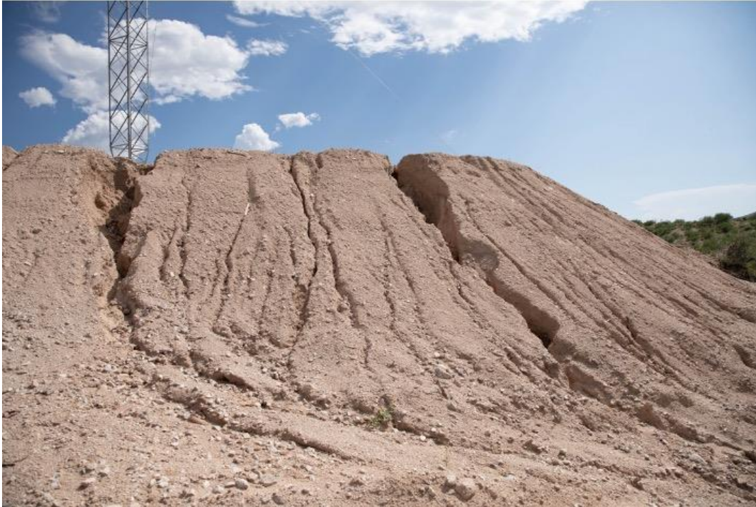
Figure 5. Fissured slopes at tower pad site S1-095/3, July 29, 2024.