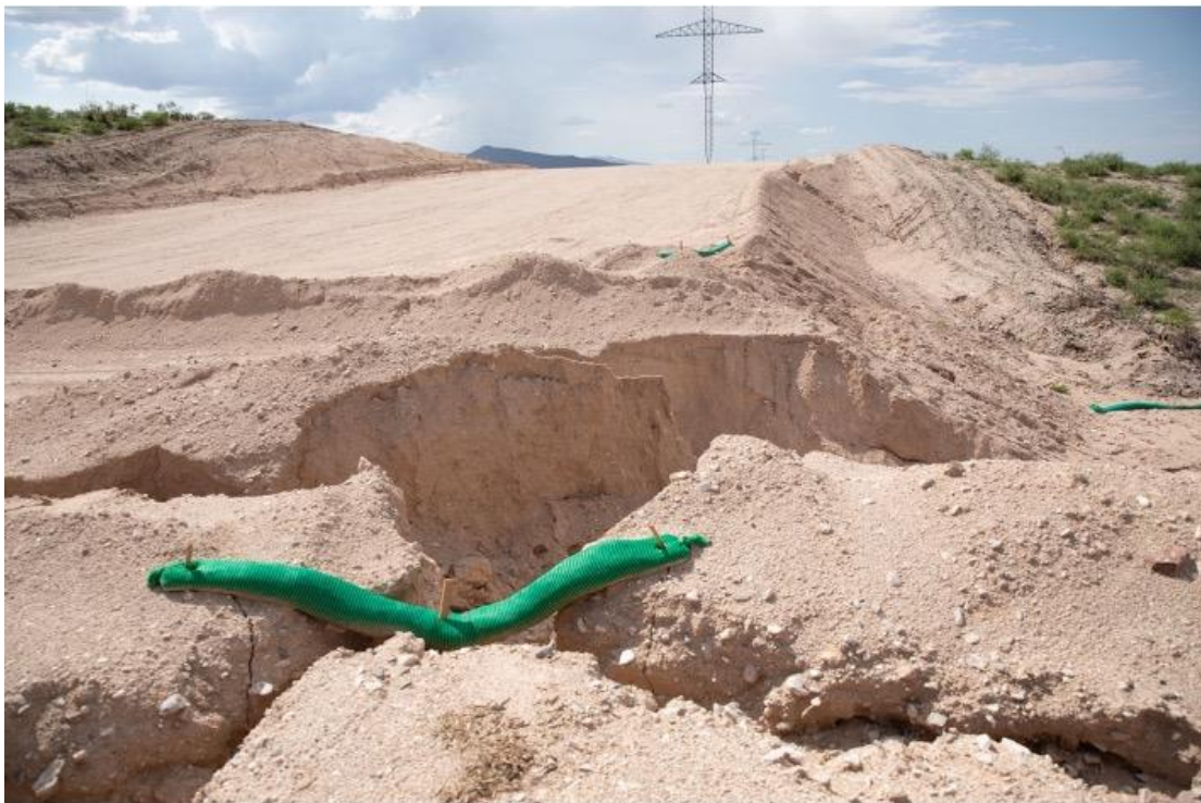
Figure 6. Gullies forming on pull/tension sites near 32.364137°, -110.492155°, July 29, 2024.