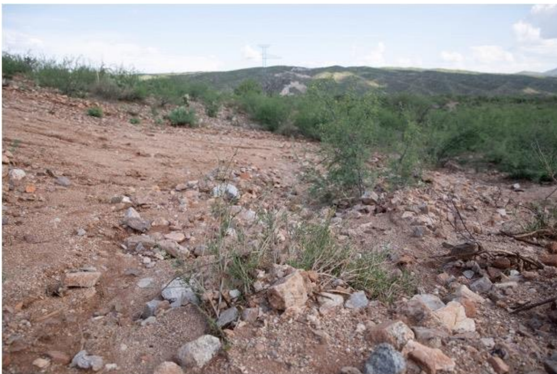
Figure 1. Surface wasting below tower pad site S1-098/2, July 29, 2024.

The denudation and degradation of land surfaces and loss of soil productivity directly impact habitat and water quality. As plants are covered in sediment, water retention decreases, edge effects and habitat fragmentation increase, and the potential for invasive plant colonization increases (Figure 1) (2013 FEIS pp. 4-28, 4-64). As silts and clays are mobilized by precipitation, the decreased water quality in the San Pedro River and its tributaries negatively impacts fish, amphibians, aquatic invertebrates, and aquatic birds, either directly or by decreasing foraging success (2013 FEIS pp. 4-65 to 4-67).