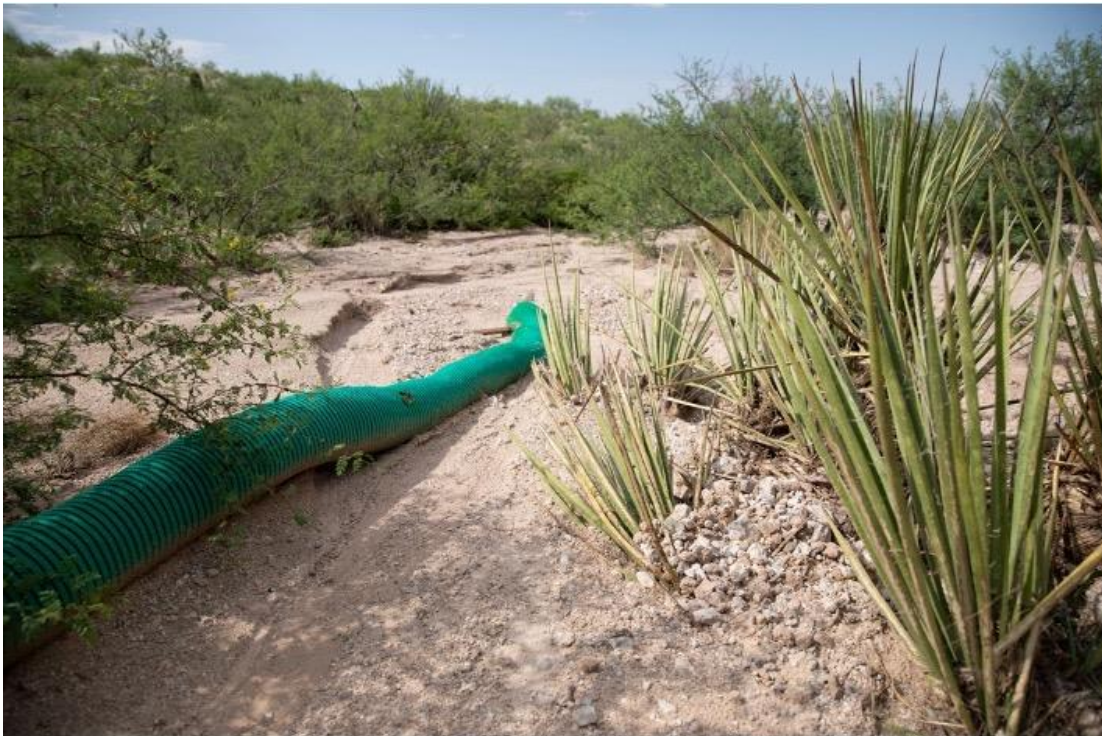
Figure 4. Silt fences made of synthetic material dispersing into the drainages near 32.364137°, -110.492155°, July 29, 2024.