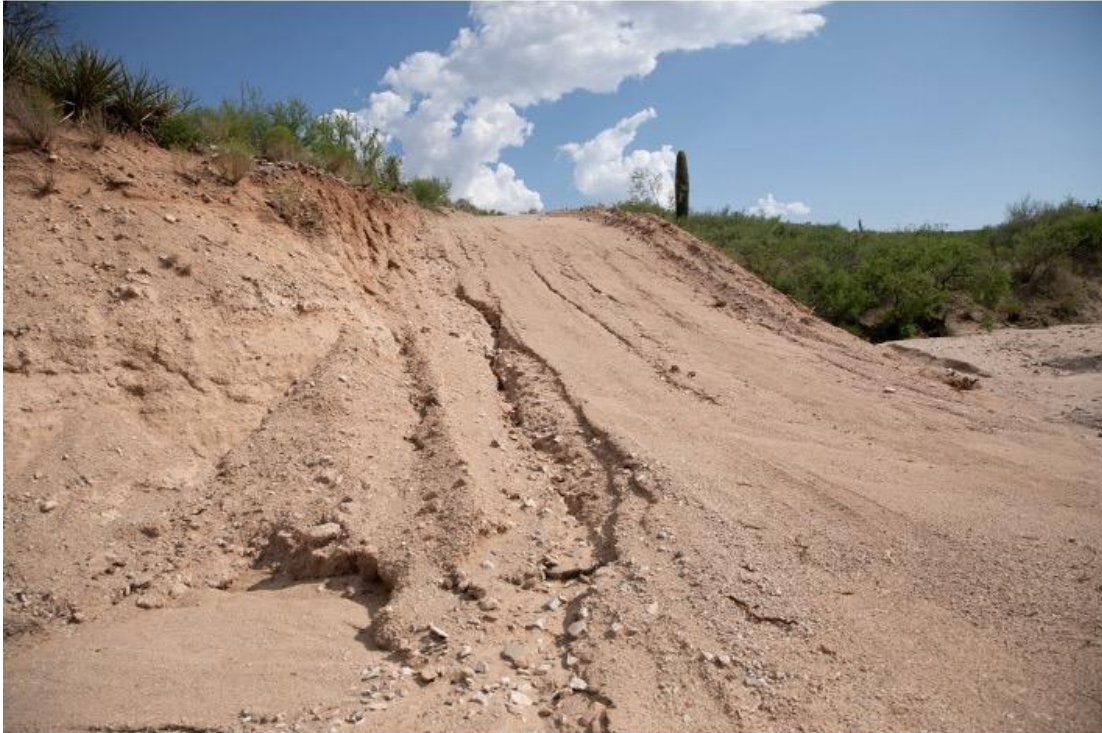
Figure 3. Rills and ruts forming on access road near 32.359648°, -110.486519°, July 25, 2024.