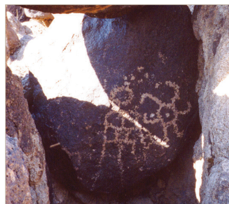
Sun dagger.