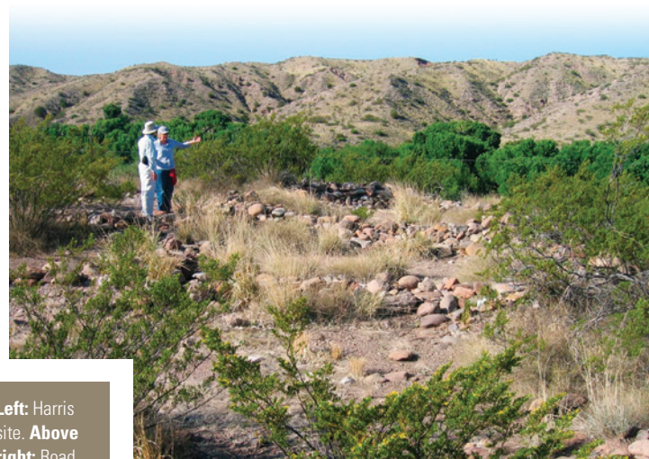
Left: Harris site. Above right: Road Map Pueblo. Bottom right: Room at Road Map Pueblo.

(520) 882-6946 | www.archaeologysouthwest.org