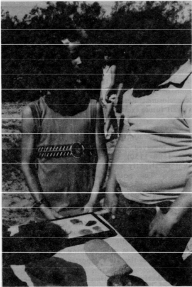
The artifact display brought out to the site was the Initial focus of attention at the Valencia Site.

Arizona Archaeology Week 1989 was busy and highly successful throughout the state. This year's theme was "Tour the Past." A weekend-long "Archaeology Fair" in Phoenix featured the current excavations at Pueblo Grande and an open house at the adjacent Museum. Offerings over the rest of the state were numerous and diverse.