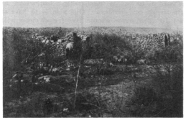
Two stone-walled buildings at Romero Ranch in 1910.

In the mid-1800s, Francisco Romero built his stone-walled ranch buildings atop an ancient Hohokam village in what is now Catalina State Park. Romero's ranch is mostly rubble now, but some foundation walls are still visible. A photograph from 1910 gives us some feel for what the original ranch would have been like, but to feel the isolation of Romero's ranch and the fear inspired by hostile Apaches requires a vivid imagination for the increasingly urban modern Tucsonan.