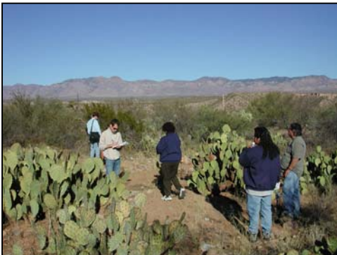
One Valley, Many Histories fieldwork.