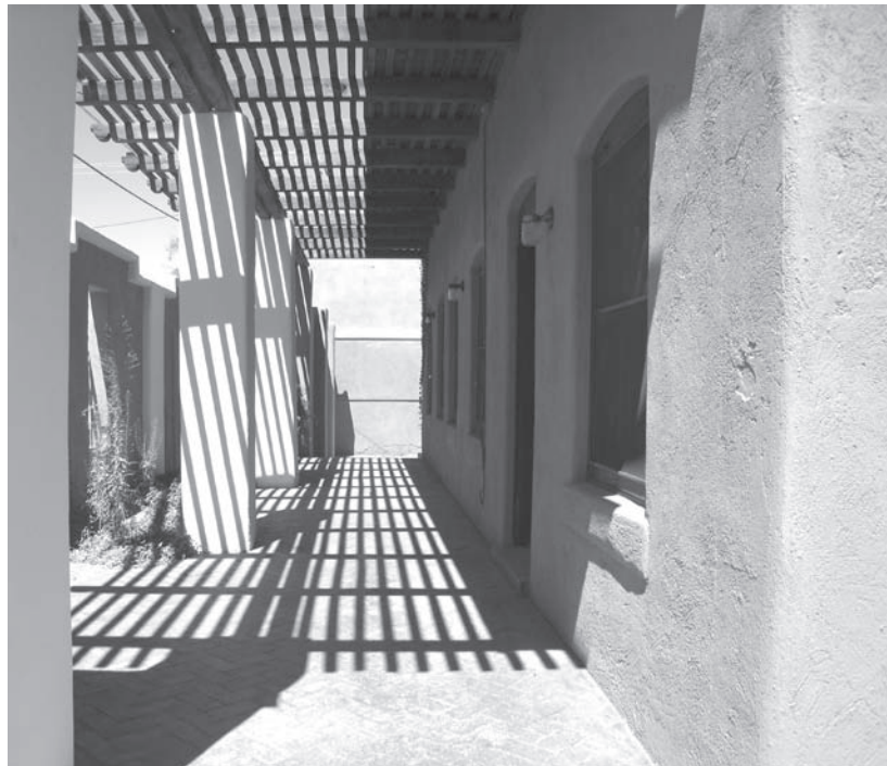
A view of our new headquarters at 300 N. Ash Alley, Tucson, Arizona, 85701. Stay tuned for details on the exciting transformation we have planned—and thank you for your support!