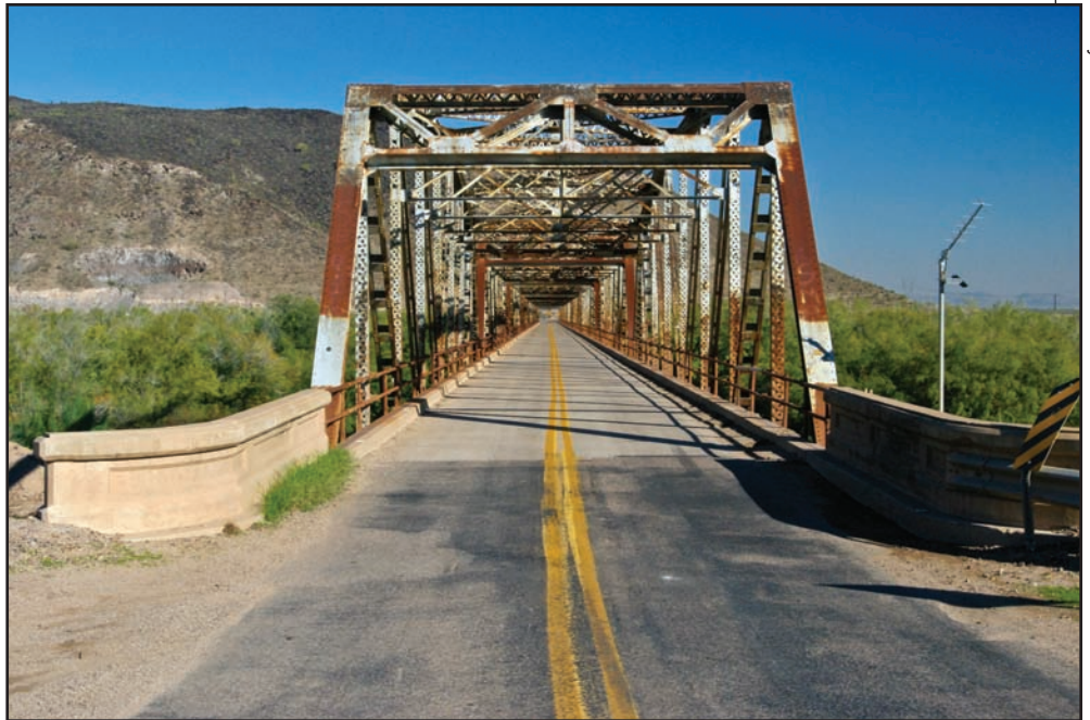
Looking east along the Gillespie Dam Bridge.

ing the historical character of the bridge through the rehabilitation process, which is scheduled to begin in 2011, after five years of planning. Concrete abutment and pier footings will be reinforced and refurbished; broken, bent,