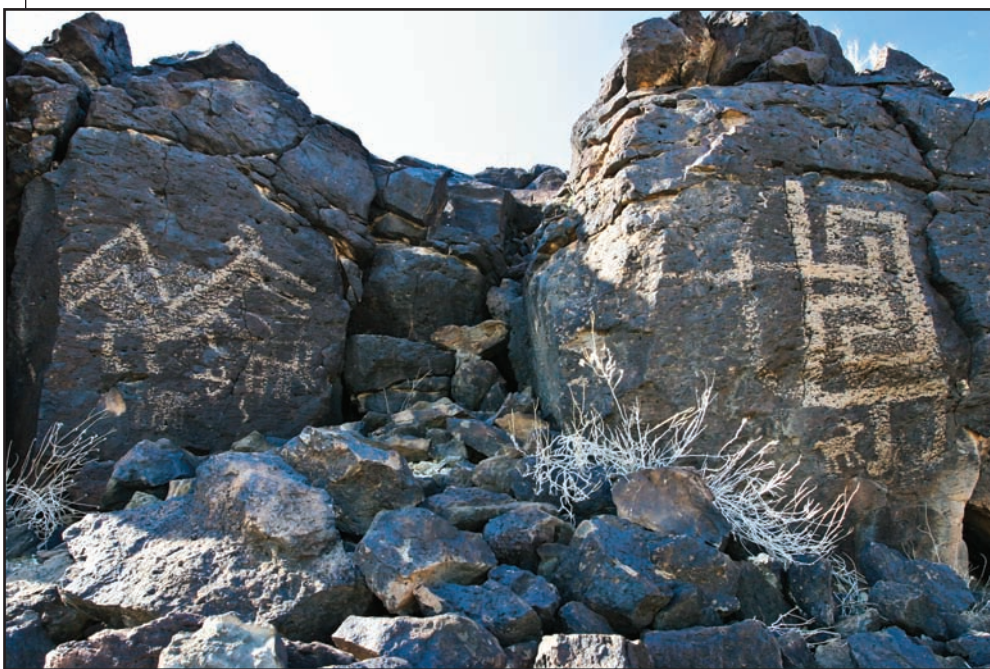
This distinctive pair of petroglyphs is extraordinarily large. Together, they convey a dynamic scene of a hunter with bow and arrow (right) aimed at a prey animal (left). The hunter image has had a second, very bold design of interlocking scrolls pecked over it.

This issue of Archaeology Southwest presents several thousand years of human history along the Great Bend of the Gila. We tap the records of early travelers and archaeologists to reveal some of the hidden history of a unique, sometimes overlooked, cultural landscape.