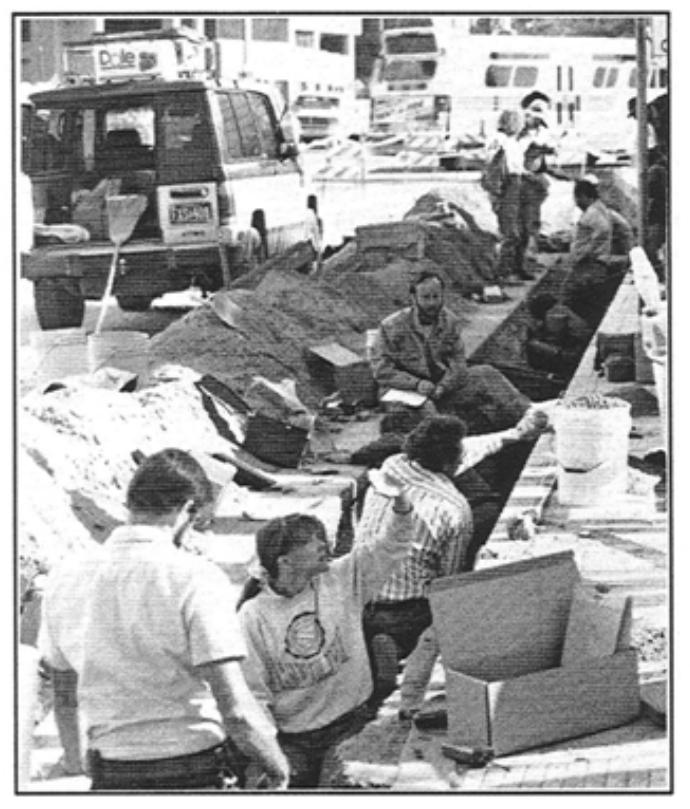
Archaeologists and volunteers working in Alameda Street trench to remove burials from the Tucson Presidio cemetery.

It was the skeletons, however, that were the focus for the public, the media, and the archaeologists. For the next 12 days most Desert Archaeology staff archaeologists and various experienced volunteers worked 10 hours a day in five areas where skeletal remains were concentrated. At anyone time during these first two weeks as many as 12 excavators delicately exposed burials found in the trench, while 50 to 100 interested people watched and asked questions of the ever patient crew.