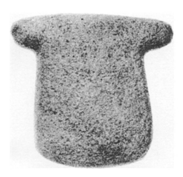
Hohokam T-shaped stone from southern Arizona. Arizona State Museum, University of Arizona.

Archaeology in Tucson 3975 North Tucson Blvd. Tucson, AZ 85716