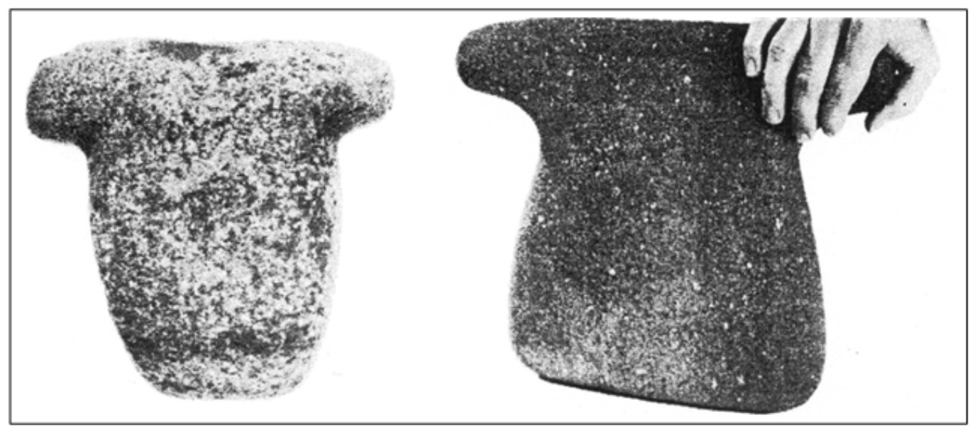
Figure 2. Hohokam T-shaped stones (Photographs by Helga Teiwes, Arizona State Museum, University of Arizona).