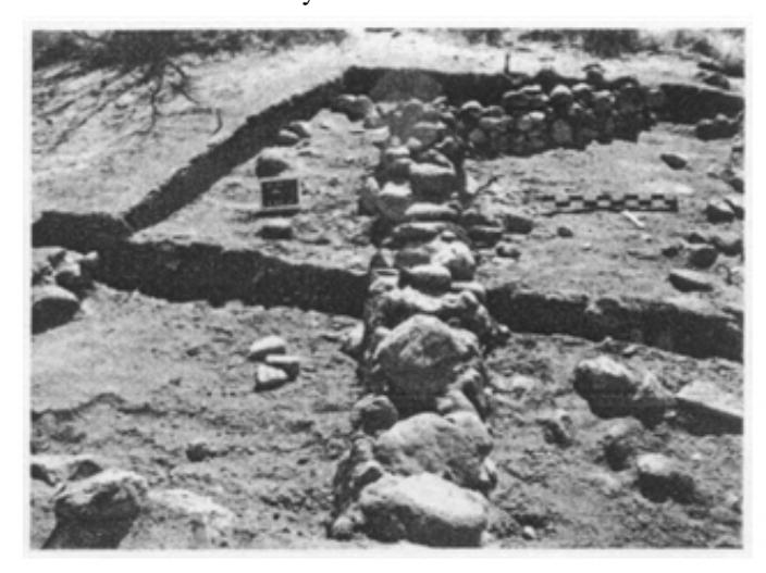
Later view after the fallen rocks were removed to reveal the base of the compound wall.

home when we found that the wall turned in the exact opposite direction of what we had anticipated. It now appears that there may have been a special alcove at the southwestern corner of the compound. We were not able to expose the entire corner during this phase of the project, so the exact nature of this area is not yet known.