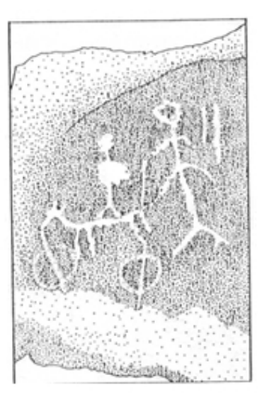
Picacho Mountain petroglyph. Human figures and horse(?) probably early historic. Other elements are Archaic.

Armed with this understanding, it was possible for Wallace and Holmlund to attribute different styles of rock art to the Archaic, Hohokam, and protohistoric (presumably Upper Piman) cultures of southern Arizona. This led them to the further determination that the medium of rock art was associated with a different social context for each of these three cultures. The dating of rock art styles, together with data on how boulders had been broken and displaced after petroglyphs had been