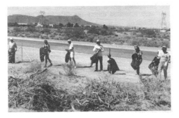
Archaeology in Tucson members cleaning up the Valencia site after the fence was completed.

In 1988, to curtail damage that was being caused to the Valencia site by pothunters, the Institute convinced the State of Arizona, the City of Tucson, and private contributors to fund construction of a fence around the site. Signs were erected at that time to indicate that the Valencia site is protected by state law, and AIT members were recruited to help clean up litter at the site and to fill in many of the holes left by pot-hunters. And for the past couple of years, dedicated AIT members have spent a great deal of time monitoring the site for evidence of new pot-hunting activity.