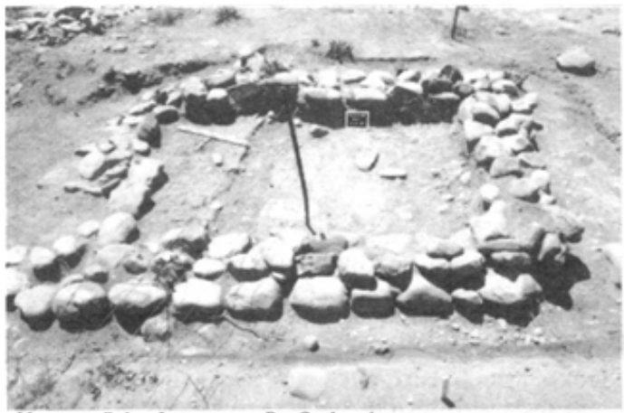
Masonry-walled surface structure, Rye Creek project.

Finally, the project turned up evidence that the Rye Creek ancients were involved in extensive mining, use, and possibly trade of argillite, a red, shale-like, sedimentary rock that is available from a source along Rye Creek. Only two other sources of true argillite have been confirmed in Arizona, both in the upper Verde Valley. Argillite may have been considered a valuable commodity because it is suitable both for pigment and for manufacture of fine artifacts including beads, pendants, bowls, and long-handled censers.