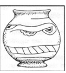
Occu Papago Black-on-red vessel, Nolic.

Important archaeological research projects conducted by the Institute during its eight years in Arizona included excavations, large scale surveys to locate and record sites, and detailed studies of rock art, all of which are still yielding major new interpretations of the peoples who once dwelt in southern Arizona.