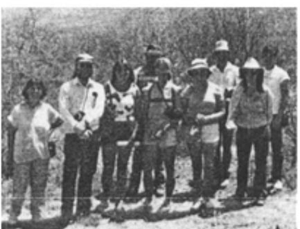
nsmute Charier Members Tour Romero Ruin Ballcourt. May 1986.

Roughly eight dollars of your dues cover the costs of the newsletter and membership activities. The remainder goes for direct support of special local archaeology or educational program undertaken by Archaeology in Tucson . We urge you to look us over carefully, and then select the highest membership category you feel comfortable with.