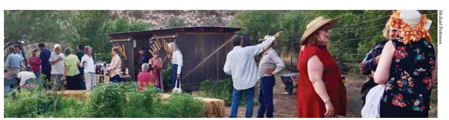
Cascabel Comunity Garden Party