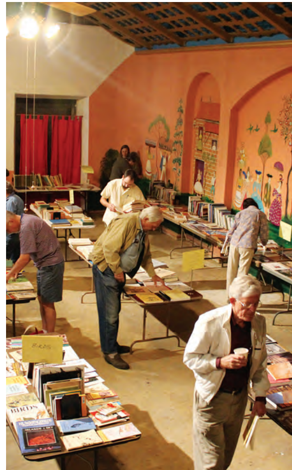
The Center's benefit book sale